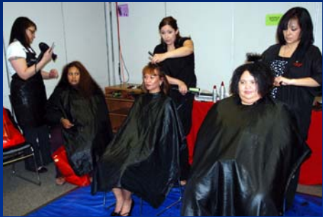
Women Helping Women